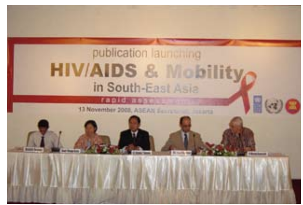
Information dissemination on HIV/AIDS

Going forward, the ASCC will continue to intensify cross-sectoral coordination and cooperation and strengthen partnership with civil society, academia and private sector. Building a caring and