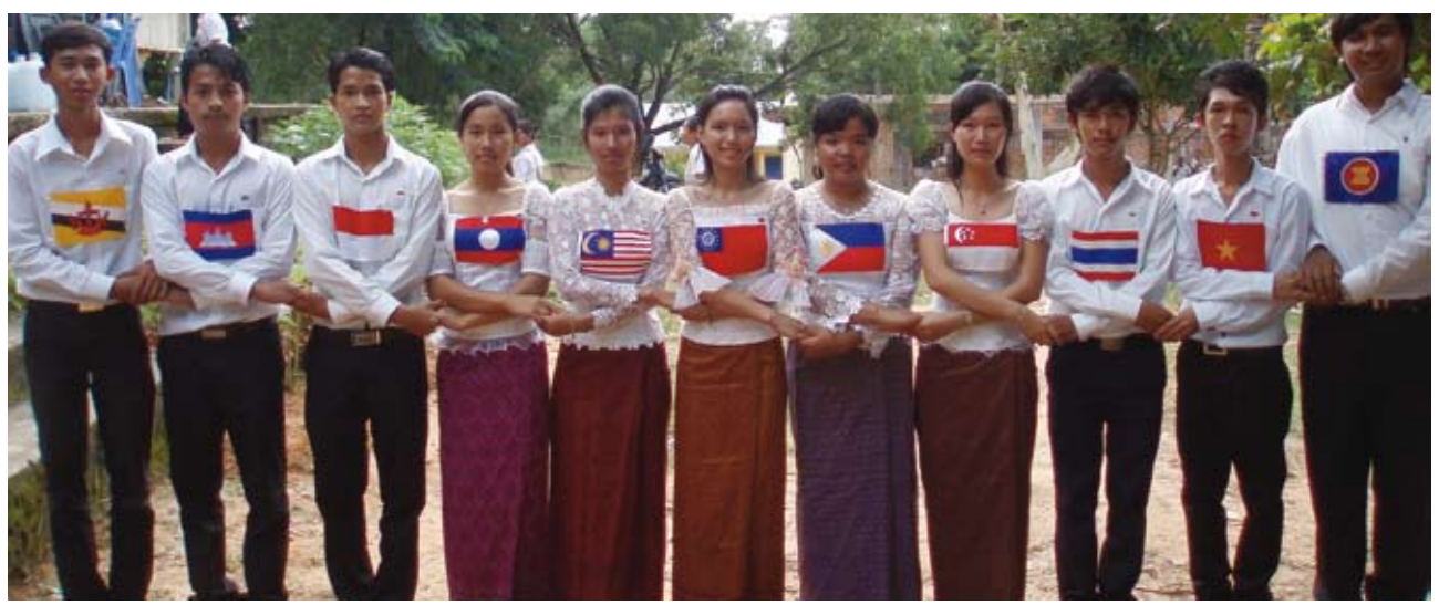
Representing the youth of ASEAN

Heads of State/Government of ASEAN– Cha-am Hua Hin Declaration on the Roadmap for the ASEAN Community 2009-2015