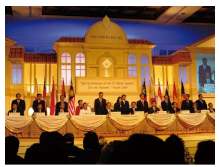
Signing ceremony of the 14th ASEAN Summit, Thailand

The ASEAN Political-Security Community Blueprint, the ASEAN Economic Community Blueprint, the ASEAN Socio-Cultural Community Blueprint and the IAI Work Plan 2 (2009-2015) shall constitute the Roadmap for an ASEAN Community (2009-2015).