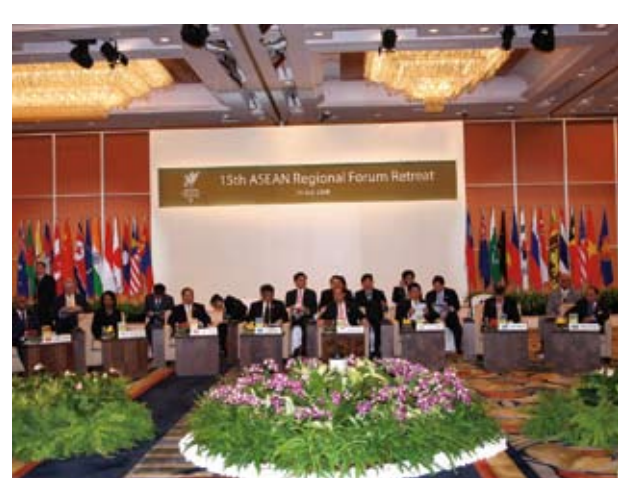
15th ARF Retreat, 24 July 2008, Singapore