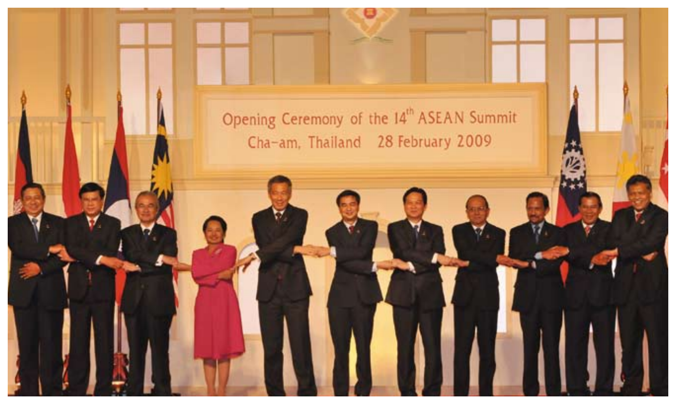
The 14th ASEAN Summit, Thailand

The Heads of State/Government of the ASEAN Member States gathered in Cha-am/Hua Hin, Thailand, for the 14<sup>th</sup> ASEAN Summit on 28 February and 1 March 2009, under the theme "ASEAN Charter for ASEAN Peoples".