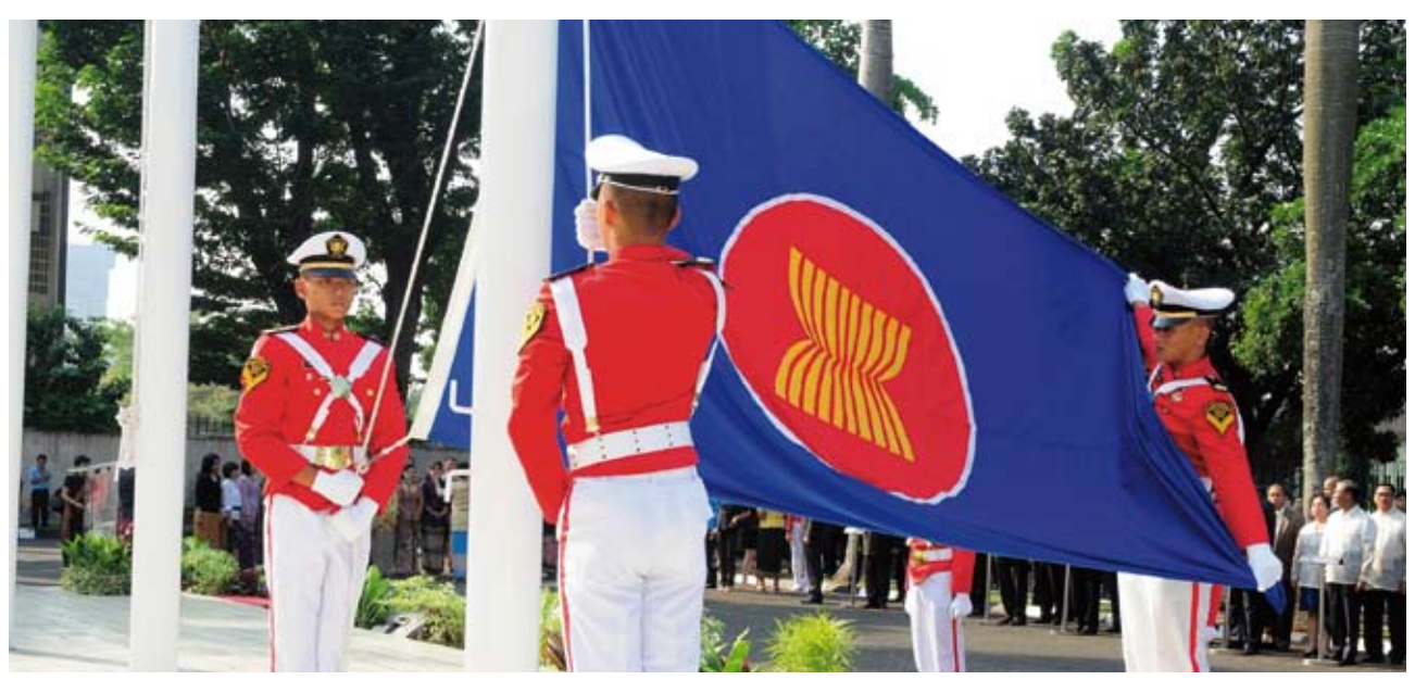
Flag Hoisting Ceremony on ASEAN Day, 8 August 2008, ASEAN Secretariat, Jakarta