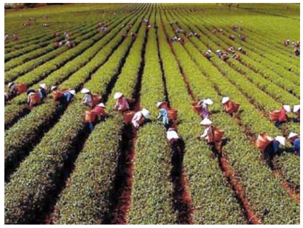
Agriculture as the main economic sector