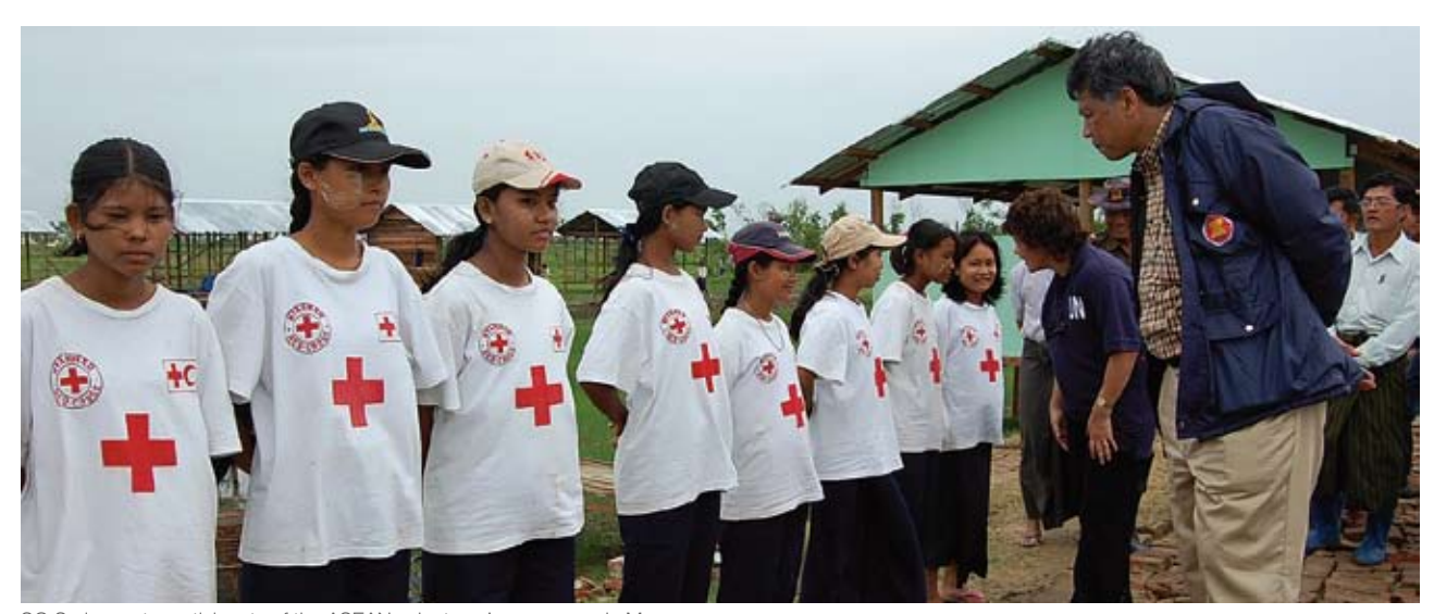
SG Surin meets participants of the ASEAN volunteers' programme in Myanmar

In early May 2008, Cyclone Nargis made landfall in Myanmar, causing extensive damage in Yangon and the Irrawady Delta, causing widespread destruction and taking nearly 140,000 lives. One year later, much has been achieved in responding to this disaster and much of this can be attributed to the work of the Yangon-based Tripartite Core Group (TCG) consisting of ASEAN, the Government of Myanmar and the United Nations.