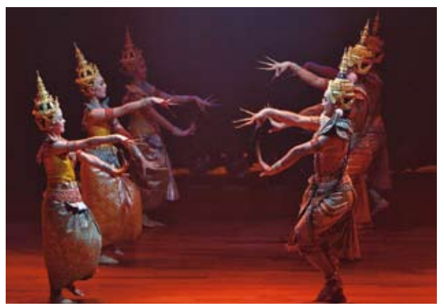
Cultural night - Commemorating 20 years of ASEAN-ROK relations