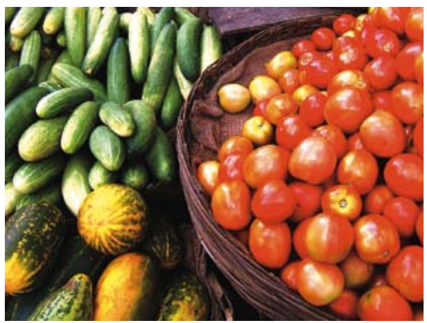
Healthy food for healthy people