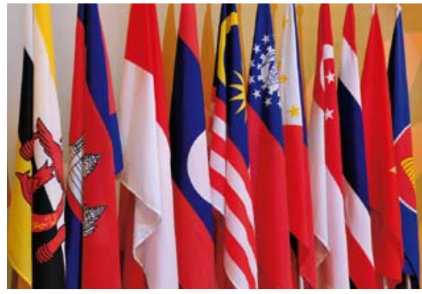
Flags of ASEAN Member States