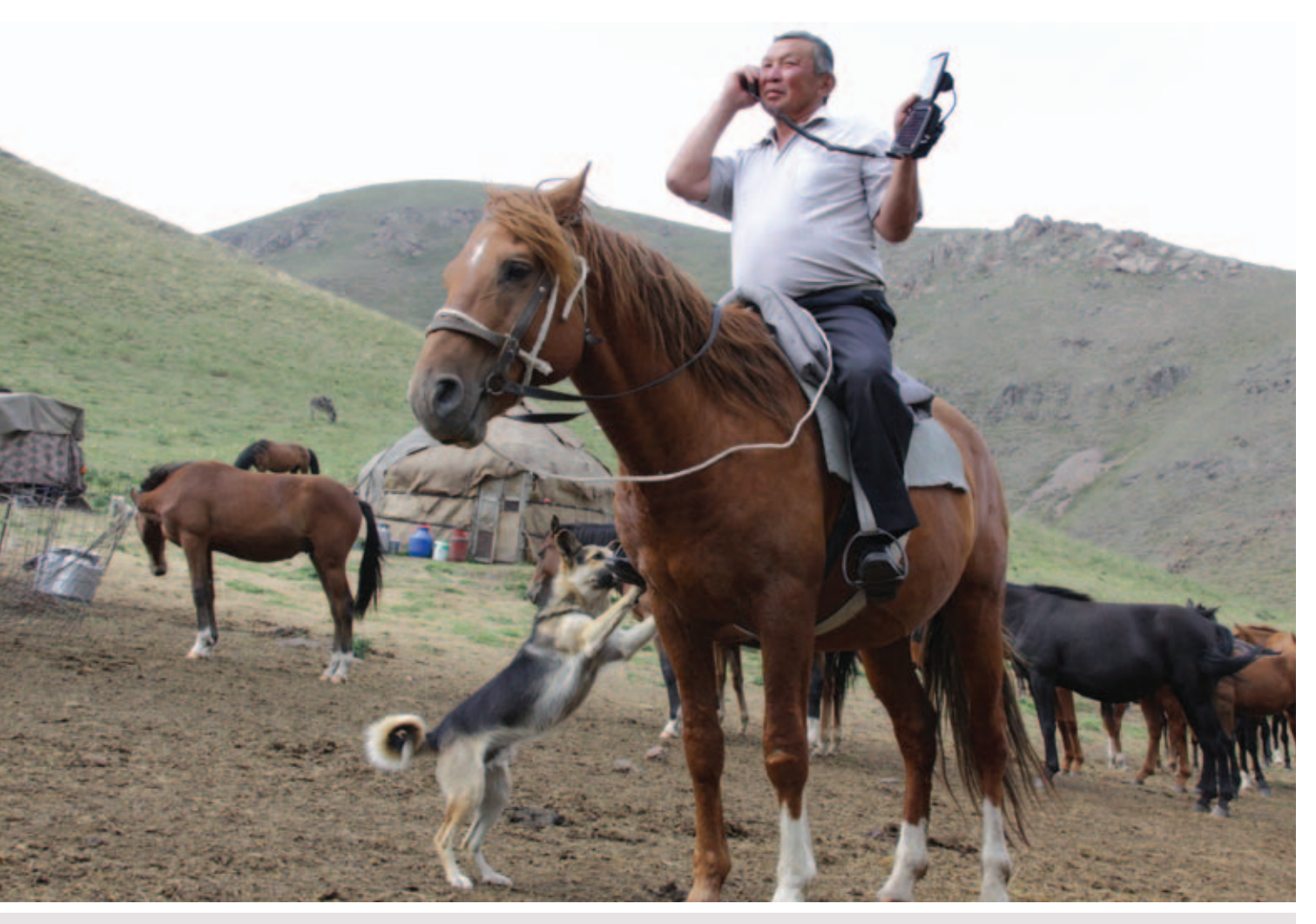
Reviving traditional nomadic pasture management - remote grazing with the use of new technologies.

The world is undergoing the most profound transformation since the Industrial Revolution. This reflects both an acceleration of long-standing trends and the emergence of new, complex, interconnected and dynamic factors.