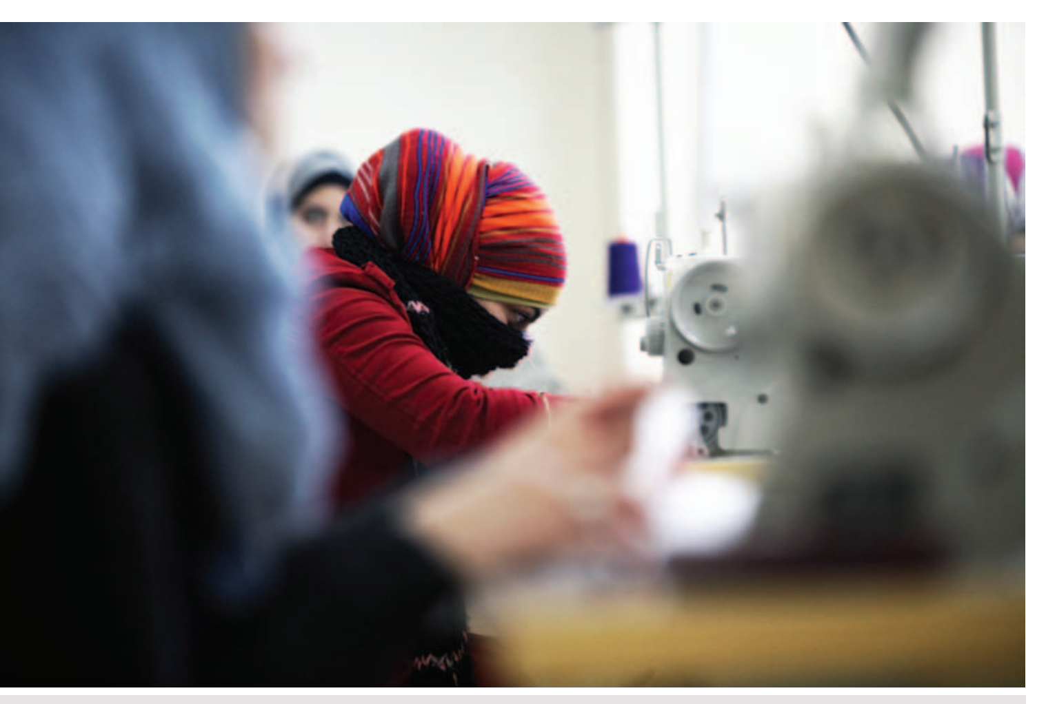
Jordanian women receive training in the Vocational Training Centre in Jarash, Jordan.

involving leading academic and research institutions as well as 'think tanks'. The policy research agenda will focus on ways to eradicate poverty and reverse growing inequalities and exclusion, with a commitment to core concerns such as gender equality and women's empowerment. It will advance knowledge about how to bring together and balance choices across economic transformation, social inclusion, environmental sustainability, and democratic governance, while dealing with an array of risks from natural and man-made sources that could disrupt development progress.