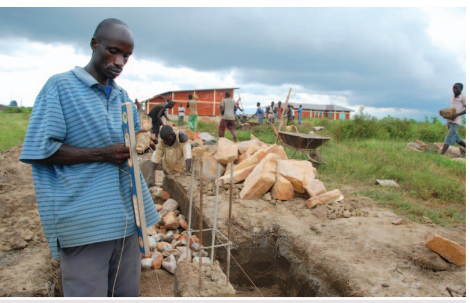
A worker stands in front of a construction site he has been helping to build.

The Global Programme will focus on what can be done only or best at the global level.