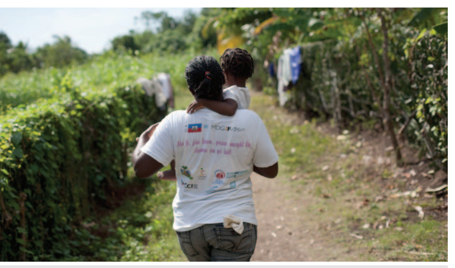
The Women's Project UNDP Haiti.

The Global Programme is at the leading edge of global partnership-building in UNDP, and serves as example and catalyst for a wider transformation of ways to work with partners to achieve results in programme countries. This effort is guided by a core set of principles: engaging a broad range of partners, each contributing different perspectives, approaches, expertise and constituencies; minimizing transaction costs and bureaucracy; working in a collaborative, open, and flexible manner; being results-driven, with mutually agreed objectives, roles and clear time frames; utilizing innovative ways to share costs and risks; and employing safeguards and ensuring accountability for performance.