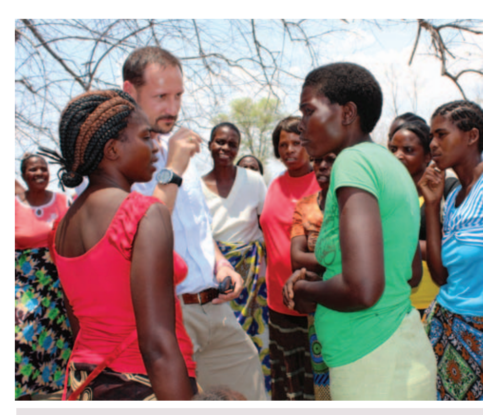
UNDP Goodwill Ambassador HRH Crown Prince Haakon of Norway visits UNDPsupported Adaptation to Climate Change Project in Kazungula.

The experience of UNDP with the Millennium Development Goals has reinforced its role as one of the few multilateral institutions that can provide the 'connective tissue' to hold a global development agenda together. UNDP is an effective thought leader and advocate that can integrate economic, social, environmental and governance issues; a bridge between actions at global, regional and country levels; and a coordinator of effort across the United Nations development system. Its evolving approach to resilience-building bridging humanitarian, peacebuilding and longer-term development efforts to reduce risks, prevent crises, avert major development setbacks and promote human security reinforces that 'connective tissue', placing the organization in a unique position to provide policy advice on integrating these issues with a risk-sensitive approach to poverty eradication.